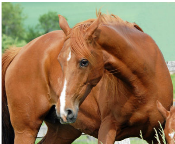
Sold to Abu Dhabi. Group III winning and placed mare KAHLOUCHA (Zeidoun x Zannouche) was a foundation brood mare at Nile Arabians. She will stay at our stud to be bred to stallions standing in Europe for her new owner.

In 2012, we sold our foundation mare KAHLOUCHA (Zeidoun x Zannouche) to Abu Dhabi. KAHLOUCHA was a successful race horse winning and being placed at Group III