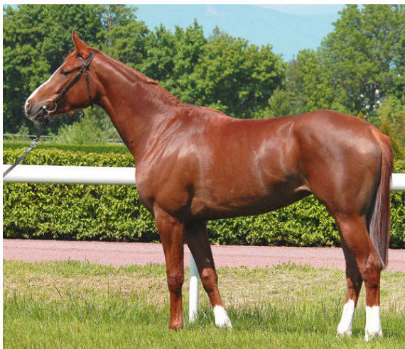
KAHRMA , 2005 (Dormane x Kahloucha) on the race track of Avenches at the age of three. After her race career she became an endurance horse in Italy.

The 7-year old DORMANE daughter KAHRMA out of the Tunisian mare KAHLOUCHA finished successfully, placed and in good condition her first two CEN* endurance competitions over 90 kilometers in Italy and is ready to attack the 120km.