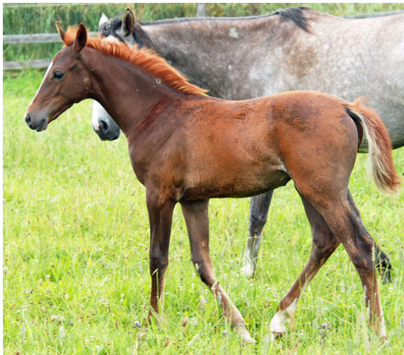
NIL ALAMOON , 2012 (Nil Bedouin x Nil Anablue by Munjiz) is 3-times inbred to French sire St. Laurent and outcrossed to the US mare UNCHAINED MELODY and the Russian sire line of NAFTALIN.

In 2012, NIL ALAMOON , another NIL BEDOUIN filly was born. NIL ALAMOON is out of NIL ANABLUE (Munjiz x Kadjouna de Nerak by Djourman). Outcrossed to the famous UNCHAINED MELODY and to the Russian sire line of NAFTALIN , NIL ALAMOON is French inbred 4 x 4 x 5 to ST. LAURENT , 4 x 5 to BAROUD III and 4 x 5 to MANDRAGORE .