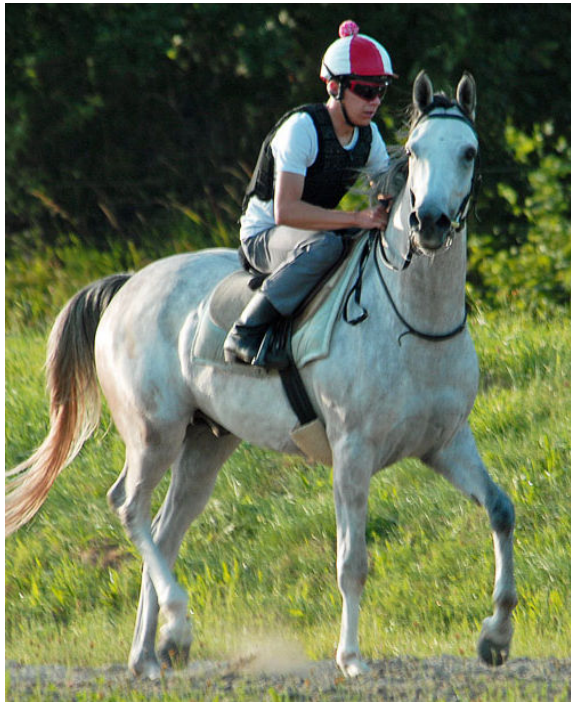
NIL ASHAL, 2008 (Nil Bedouin x Nil Abiat by Darike). Best Swiss bred race horse in 2012.

NIL ASHAL was rather late in his development and we had to give him enough time to grow and mature. In the meantime he became a big horse with 1.62 and we hope that we will have a good next season.