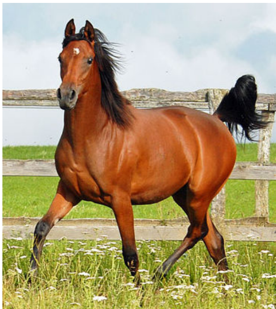
NIL KAMLA , 2011 (Dahess x Kahloucha by Zeidoun). This yearling filly represents mainly a cross between Tunisian racing lines and the Amer blood of Saudi Arabia.

Our further DAHES progeny are NIL IFFRA , 2011 (Dahess x Nil Incipit by Dormane), NIL KAMLA , 2011 and NIL KEBIRA , 2009, both out of the Tunisian Group III winning mare KAHLOUCHA (Zeidoun x Zannouche). We hope that some of these young horses will show their racing potential in future.