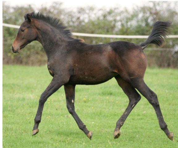
MISS SPIRIT, 2012 (Spirit One x Miss Lloyds), thoroughbred filly with a balanced pedigree mixed of stayer and sprinter blood.

Last summer we bought the thoroughbred filly MISS SPIRIT (Spirit One x Miss Lloyds by Take Risks) at the age of three months. SPIRIT ONE 's first generation was successfully running in France. Two of his progeny reached Black Type and in the sire statistic of the first covering year SPIRIT ONE is ranked on fifth place. The Anabaa Blue son SPIRIT ONE won five races included the Arlington Million Stakes (Group I).