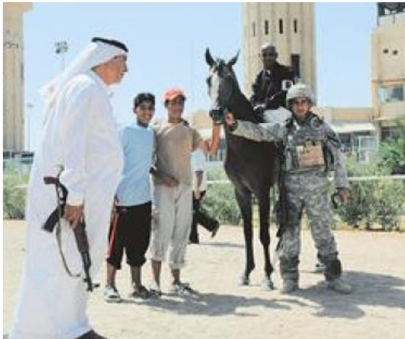
Race horse owner with his Arabian race horse at the race track in Bagdad in 2007. Since 1920 every Tuesday and Saturday is race day. Except during the war the track was closed for three months. The horses there are still close to the original Arabian type and wouldn't have a chance to win the show in Paris.

Till this day, racing as a selection criteria for the Arabian breed is almost unknown for many breeders and lovers of Arabian horses. Besides breeding Arabian race horses it is one of our objectives to make Arabian horse racing more popular among breeders. Therefore we started to offer shares in Arabian race horses. That allows a new owner to participate in a race horse together with other owners under a stable color for a small monthly amount. This is an easy way getting directly and personally involved in this fascinating world of Arabian horse racing.