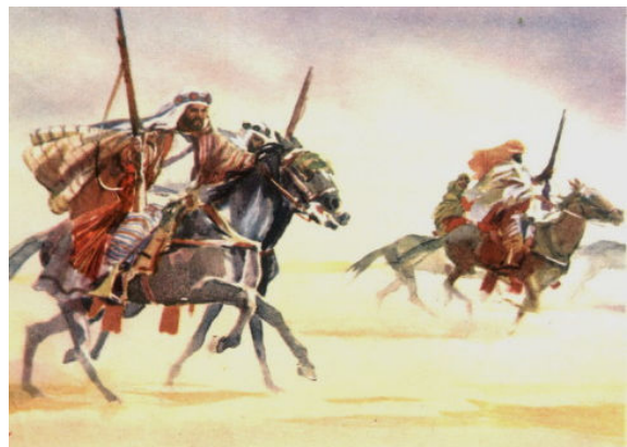
Bedouins being on a prowl. Speed, hardness and stamina decided about surviving or dying.

Without a rigorous selection on the race track during the last century, Polish, Russian, Egyptian or French Arabians wouldn't have developed in such a prominent way to current status and quality.