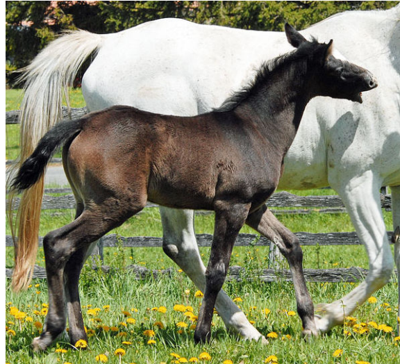
NIL AZIZ, 2012, (Dahess x Nil Abiat by Darike) at the age of 3 months. The colt is a half-brother to Swiss Champion Race Horse NIL ASHAL by NIL BEDOUIN.

2012. Under the six best rated 3-year olds are three by DAHESS .