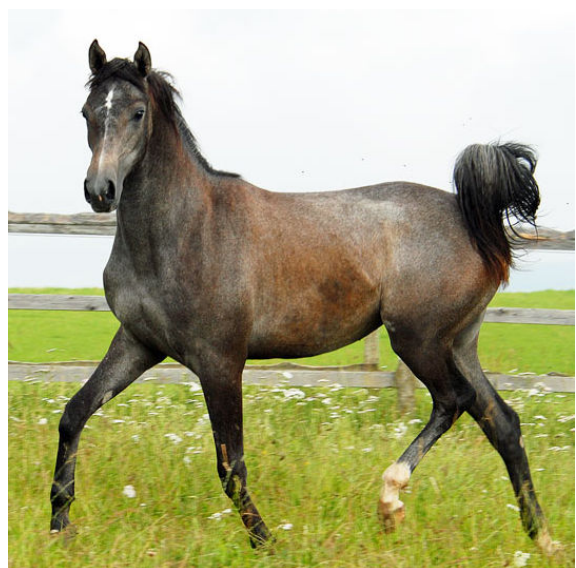
NIL IFFRA, 2011 (Dahess x Nil Incipit by Dormane), a filly out of our N-Line. NIL IFFRA is a half-sister to the race winners NIL INSHA and NIL ISHAN IBN AL SAKBE, both by Al Sakbe.

At 2012, one DAHESS foal was born at Nile Arabians. It is NIL AZIZ out of NIL ABIAT , (Darike x Kadjouna de Nerak by Djourman) belonging to the French family tracing back to Zenab. Crossing AMER to this family produced already very successful race horses in Qatar, e.g. Group I winner TABARAK (Nizam x Altesse D'Aroco) or Group I winners AL TAIR and AL ANQA both by AMER out of ALTESSE D'AROCO . Another representative of this cross is multiple Group I winner AZIZ ASF (Amer x Aziza D'Aroco) who was the leading race horse in Qatar at the 2010/11 season.