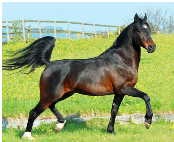
Race winner and Group II and III placed NIL BEDOUIN, 1999, (Barour de Cardonne x Nil Tahani by Versal). His first foal on the race track was a winner. Representing mainly a French / Russian cross we recommend him for endurance and race horse breeding.

Our Barour de Cardonne son NIL BEDOUIN confirms his former quality on the race track also as a sire. He raced successfully with a total of 4 wins and was placed at Group II and III level. He is actually the highest rated Arabian sire by the Swiss Stud Book. NIL BEDOUIN is SCID free and CA clear .