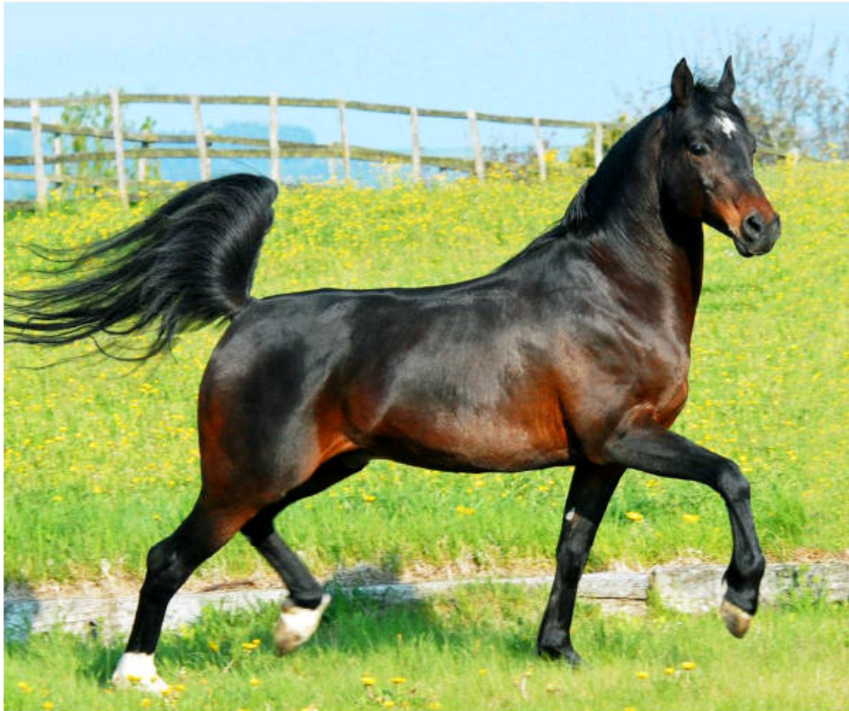
NIL BEDOUIN – Champion race horse and Champion producer

The qualities as sire of race- and endurance horses of the 15 years old NIL BEDOUIN (Barour de Cardonne x Nil Tahani) become apparent. This stallion represents best old Egyptian, Russian and French blood, a combination you rarely find in horses today. His son NIL ASHAL (Nil Bedouin x Nil Abiat) is the most successful race horse bred in Switzerland. Another son of NIL BEDOUIN , the five years old BC NIHAL out of NIL NURA has passed the Swiss race performance test.