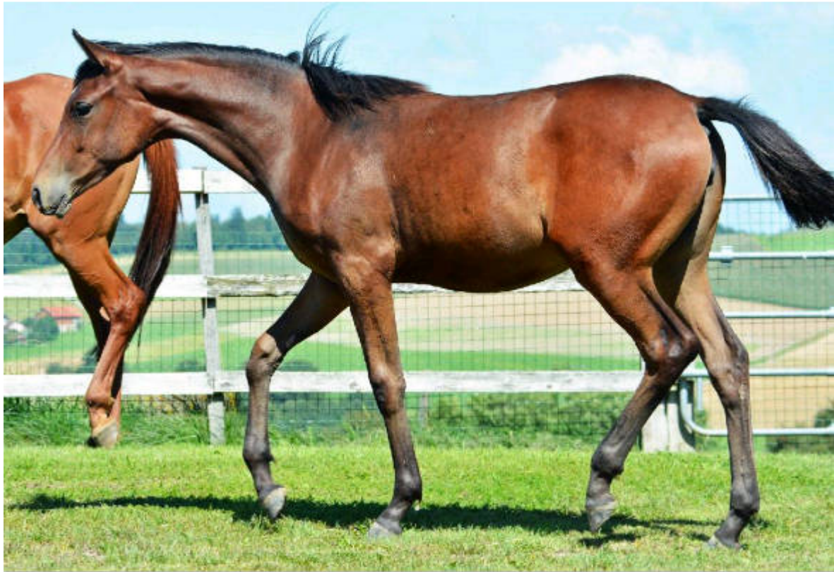
2014 weanling REEM ALFALA exported to Abu Dhabi

We hope that REEM ALFALA will have a successful career in the sport and/or in breeding.