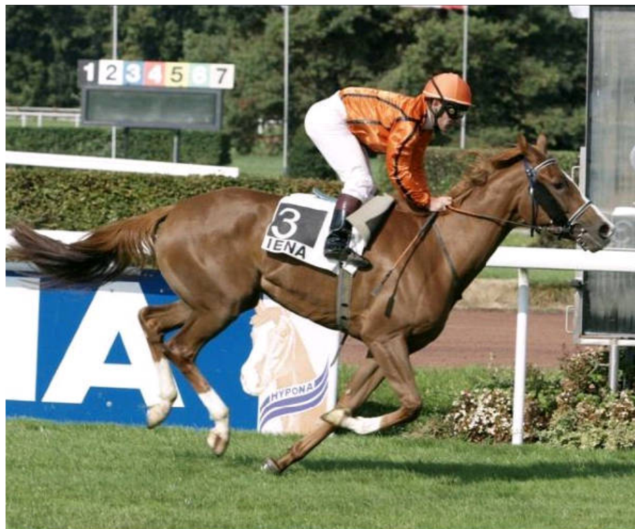
Endurance mare KAHRMA, 2005 (Dormane x Kahloucha)

With 3 and 4 years, KAHRMA has been trained by Franziska Aeschbacher in Avenches. She did 9 international races and was placed 7 times. In 2008 she was Champion race horse of Switzerland and passed the SZAP race performance test in 2008 and 2009.