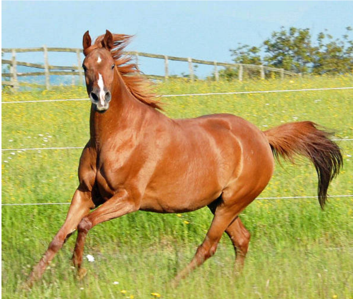
SZAP Elite mare KAHLOUCHA exported to Abu Dhabi

The pure Tunisian bred Swiss Elite mare KAHLOUCHA , 1998 (Zeidoun x Zannouche) and her 2014 born filly REEM ALFALA by DORMANE have left our stud farm in autumn and have been exported to Abu Dhabi. All crop of KAHLOUCHA are successful on the race track as well as later on in endurance up to now.