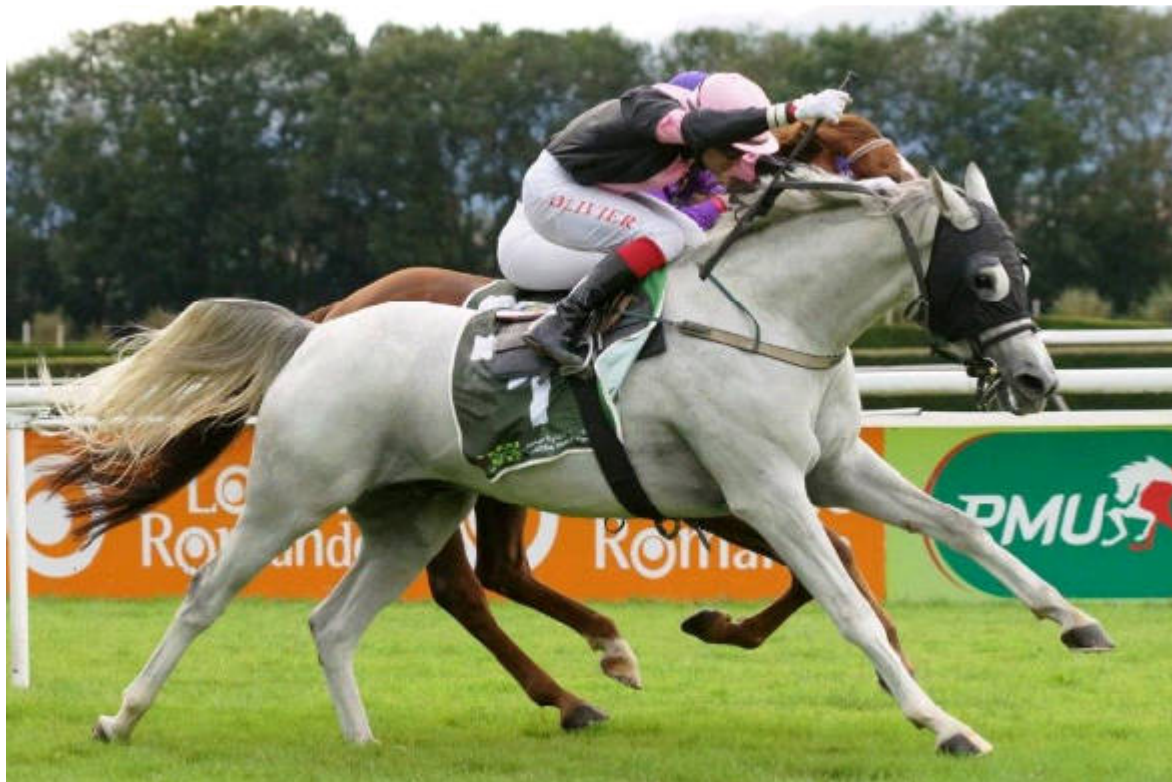
Photo: NIL ASHAL, winner after fight in the Wathba Stud Farm Cup, 2014

The outstanding Arab in our stable was again the 6 years old stallion NIL ASHAL (Nil Bedouin x Nil Abiat by Darike) out of our A-line. He was winning the title as Champion race horse 2014 for the third time after 2012 and 2013. 2014 was his best season with 3 wins, 2 third and one 5th place out of 6 starts. He was placed twice on Listed level and got black type with his third place on snow in St. Moritz in the HH SHEIKH ZAYED BIN SULTAN AL NAHYAN LISTED CUP . In the statistic of horseracing.ch, Swiss horses, he is placed 3rd out of 70 horses who did run (thoroughbreds and arabs). With his rating of 84kg he is the second highest rated horse of all native horses.