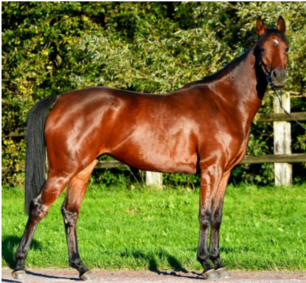
Photo: Nil Kamla, 3 years old filly in race condition.

Out of the Tunisian K-line the 3 years old filly NIL KAMLA (Dahess x Kahloucha) did her first two races in 2014 and got placed twice. With that result, 14 horses out of our breed have passed the Swiss race performance and/or Swiss endurance performance test up to now.