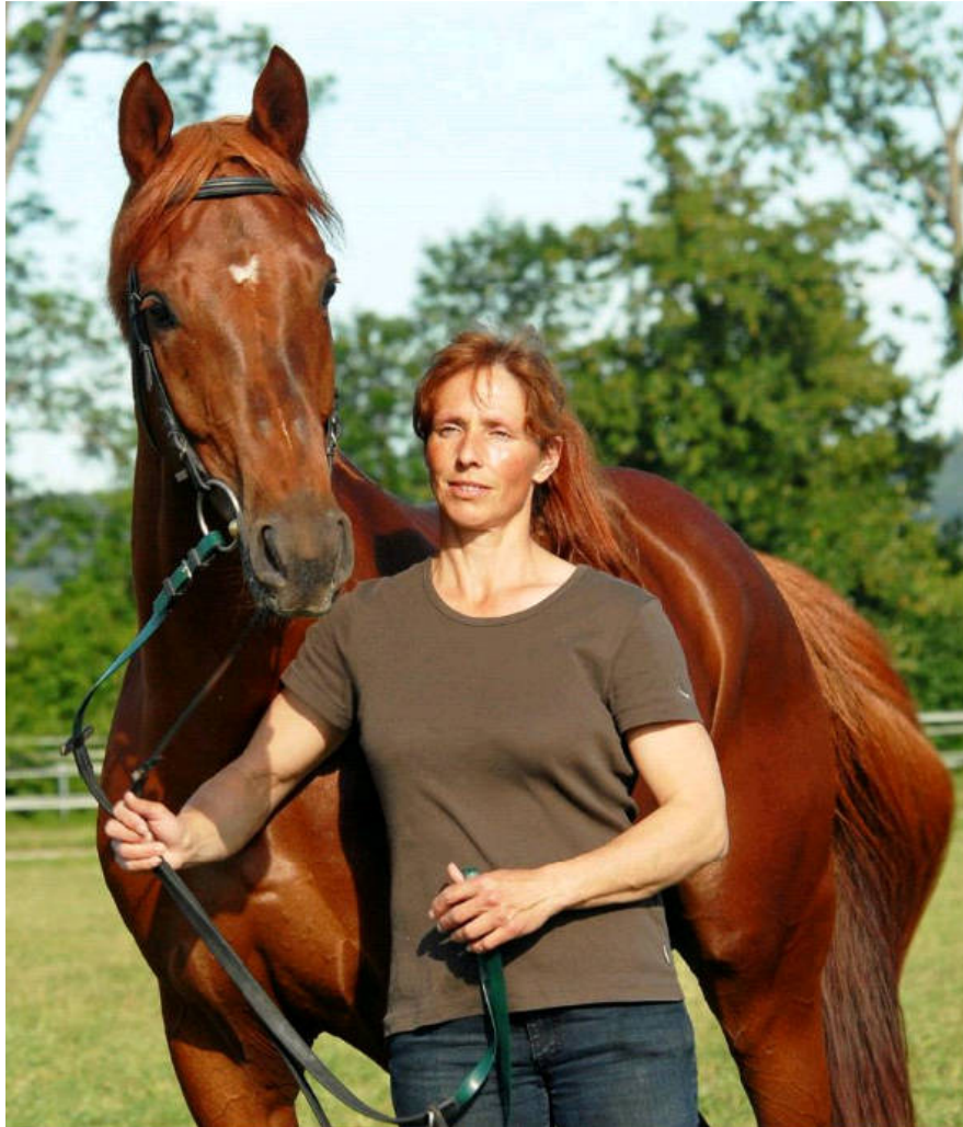
A hope in endurance in France - NIL KARAZI, 2007(Dormane x Kahloucha)

The 7 years old stallion NIL KARAZI (Dormane x Kahloucha), full brother to KAHRMA , has been exported to France after a very good race career. Champion race horse of Switzerland in 2011, he could adapt to endurance easily and was participating between September 2013 and August 2014 in 6 endurance races where he did win 3 times and finished 2 times second. Once he was winning over 90km and one time he finished 2 nd over this distance.