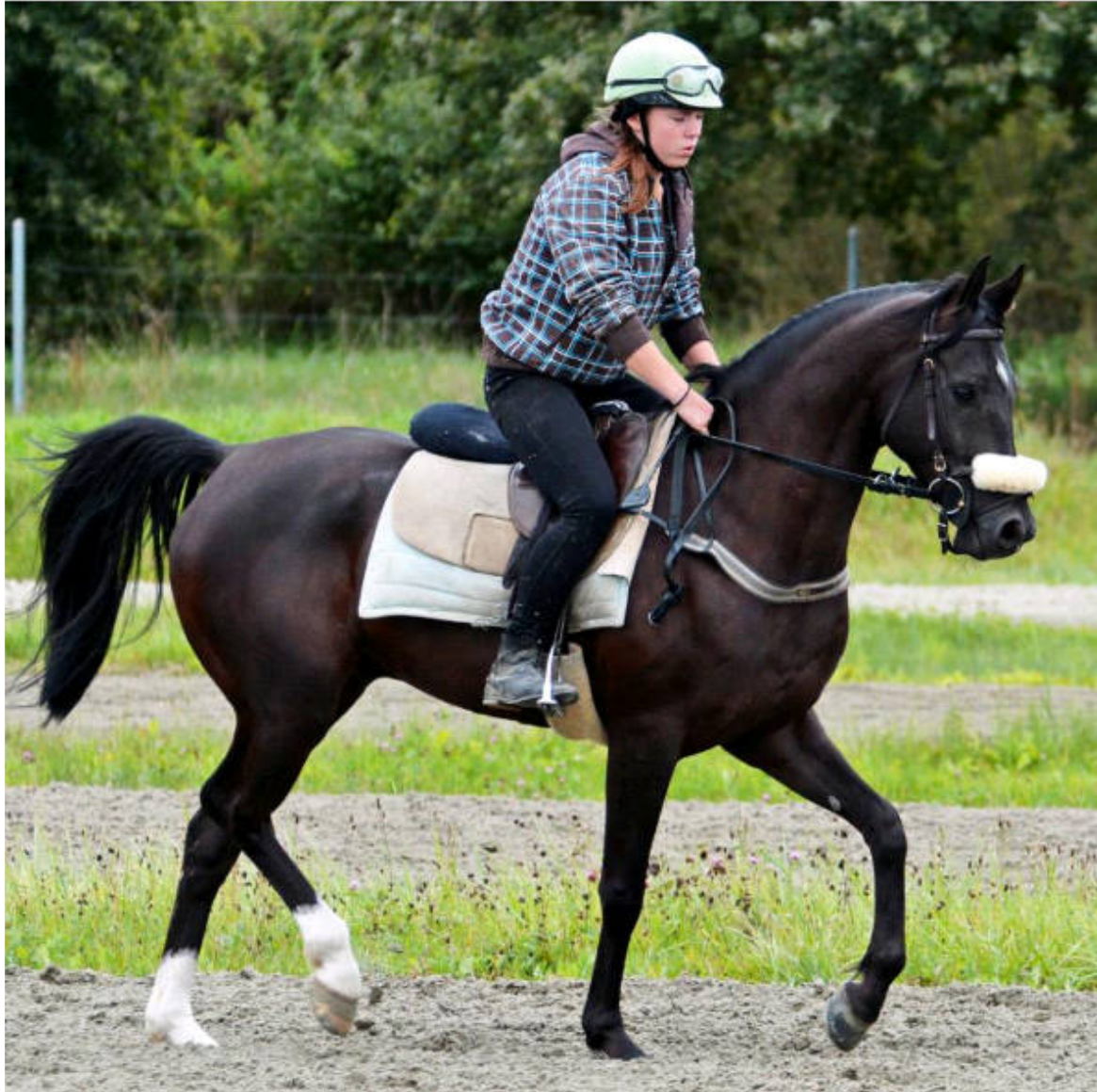
BC NIHAL , 2009 (Nil Bedouin x Nil Nura)