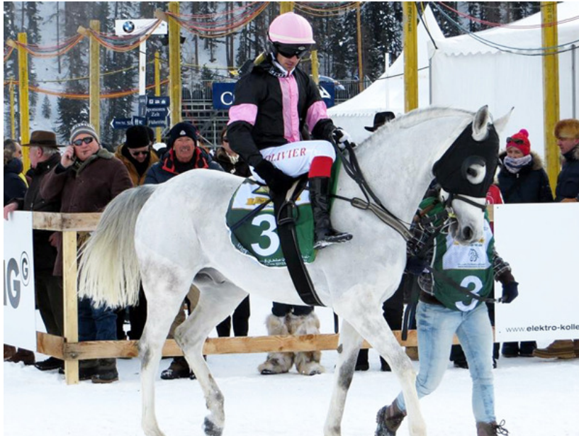
left: 2014 Swiss Champion race horse Nil Ashal with 2014 Swiss Champion jockey Olivier Plaçais in the parade ring.

The 4-year old filly Nil Kamla (Dahess x Kahloucha) was the youngest and with only two races done as a 3-year old the most inexperienced horse of the nine starters. As a big outsider she was surprising with a good fifth place only beaten by a neck by Nil Ashal and ended up with this result as best filly in the race.