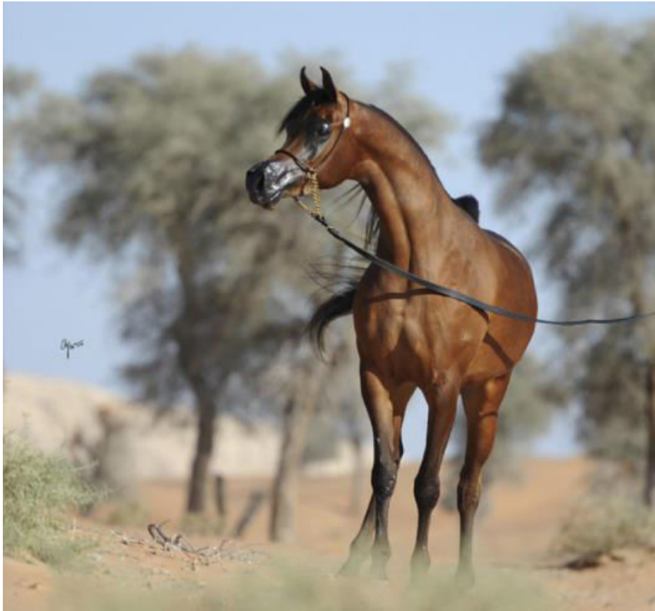
Donna Molta Bella SRA , (DA Valentino x RD Fabrenna)

2016 Gold World Champion Mare has not any progeny up to now. Anyway, a right to an embryo by the stallion FA El Rasheem has been sold for the top price € 256'000.-.