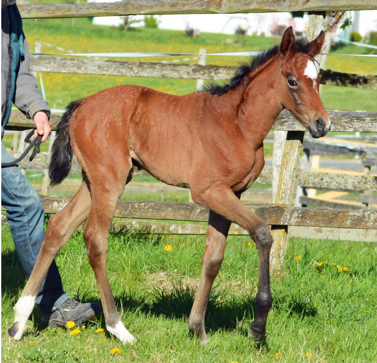
NIL FARAH DIBA, 2017, (AF Albahar x Nil Anablue). High legged, elegant filly, short back, large in shoulder and breast. Nil Farah Diba is a half-sister to Nil Alamoona, 2012 (Nil Bedouin x Nil Anablue), a Listed horse.

Out of Nil Anablue, a half-sister to Nil Abiat, by the UAE bred stallion AF Albahar (Amer x Al Hanouf) is the 2017 born filly Nil Farah Diba . AF Albahar was born in 2004 and has purely Saudi Arabian blood lines by his sire Amer and his dam Al Hanouf . Bred to Nil Anablue out of our French A-line, Nil Farah Diba represents a classical breeding outcross.