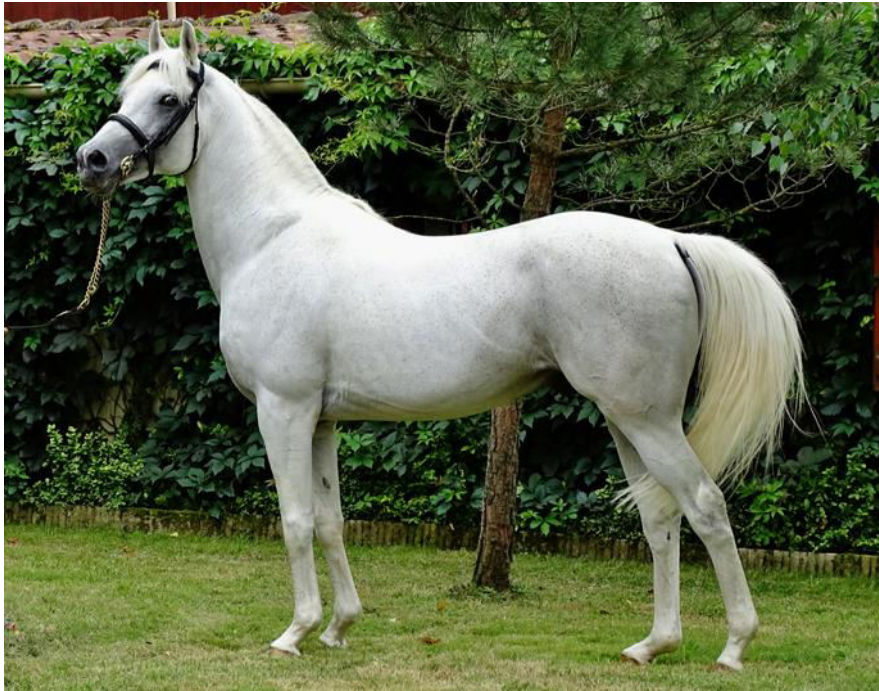
AF ALBAHAR, 2004, (Amer x Al Hanouf)

Original Arab stallion out of Saudi Arabian blood lines. Although deficient in his legs and unproven on the track, he is a superior producer.