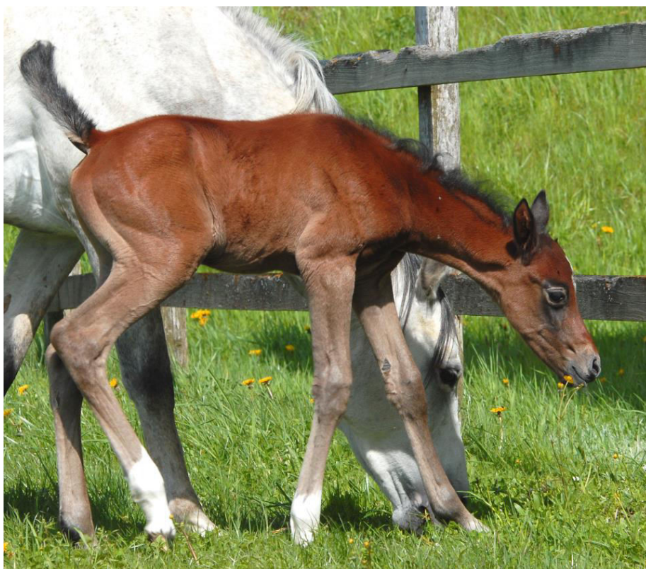
NIL ASHAL, 2008, (Nil Bedouin x Nil Abiat) is the first foal of Nil Abiat. A strong and elegant foal with good leverage in shoulder/upper arm and croup/lower leg.