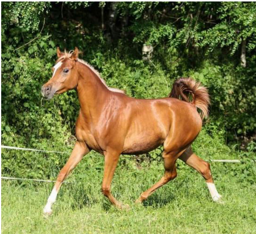
CZ KHALISHA, 2015 , (Ajman Moniscione x Nil Khaznah) is Nil Khaznah's first and only foal which she had born as a 17-yrs old.