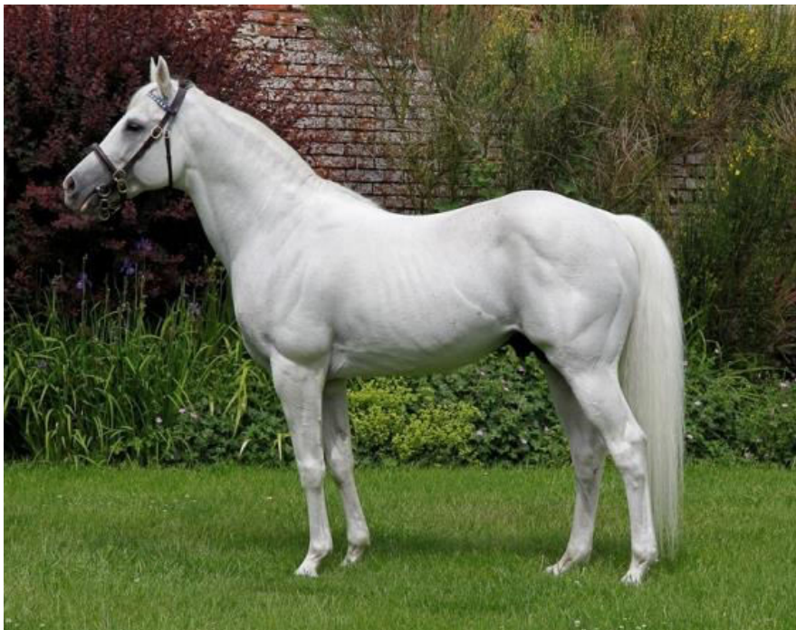
AF Al Buraq, 2003, (Amer x Al Hanouf)

He is the sire of group 1 winner AF Almathmoon (Dubai Kahayla Classic, Gr.1 PA), Alsaker (French Derby winner, Gr.1 PA) and Bint Jakkarta (Al Rayyan Cup, Gr.1 PA)