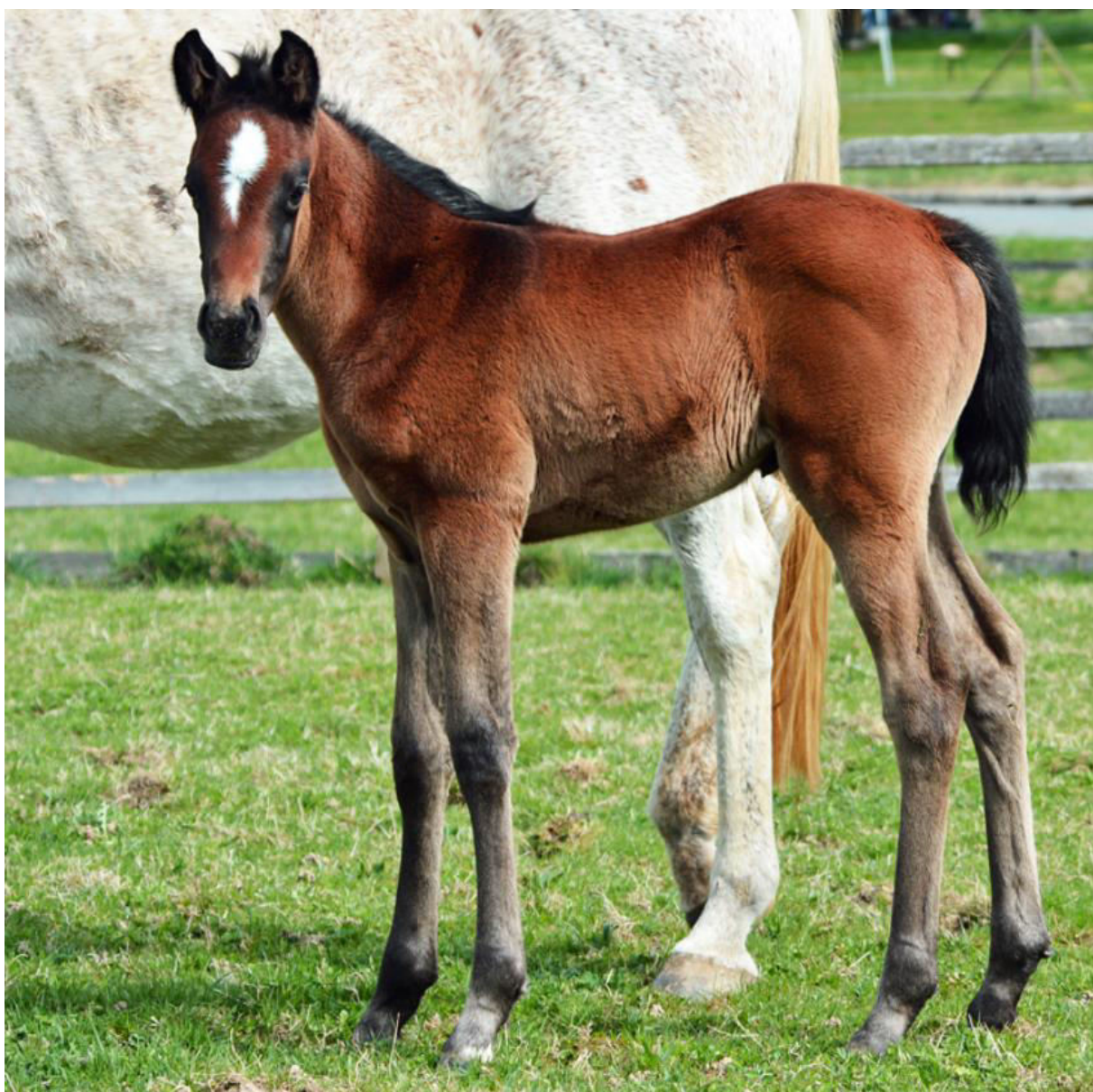
NIL ADAMIS, 2017, (Damis x Nil Abiat) at the age of two weeks. High legged and strong colt with a short back and good conformation.