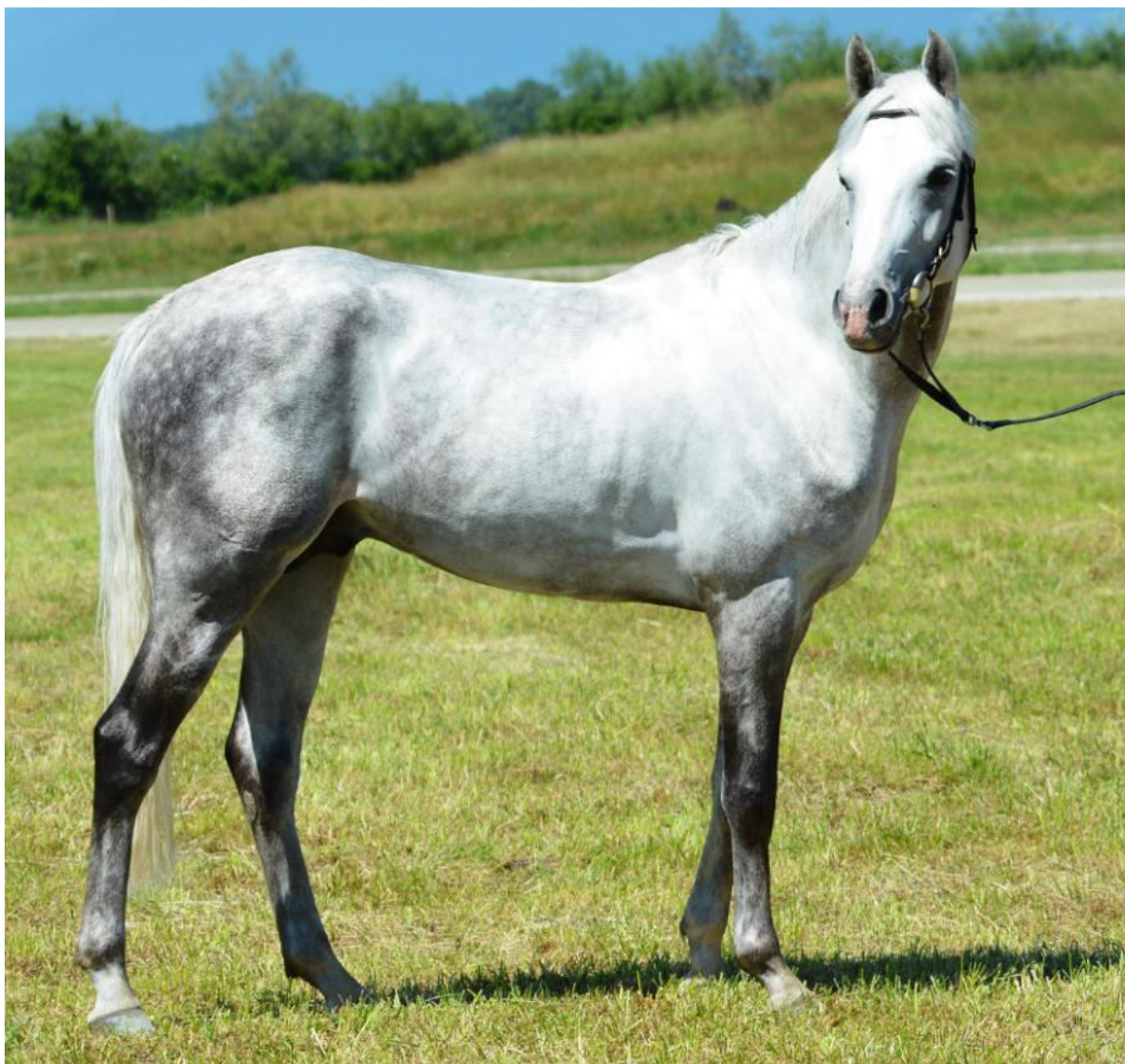
NIL AZIZ, 2012 (Dahess x Nil Abiat), Champion Arab race horse 2017 in Switzerland, followed by his half-brother Nil Ashal, 2008 (Nil Bedouin x Nil Abiat). A compact, strong horse with long shoulder. The excellent eye and relaxed expression indicate his outstanding character.