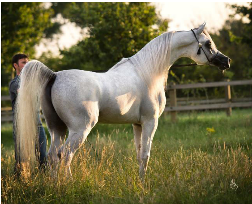
EXCALIBUR EA, 2011 (Shanghai EA x Essence Of Marwan EA by Marwan Al Shaqab)

Attending a show 20 years ago, it was immediately apparent whether the presented horse came out of Egyptian, Russian Polish, Spanish etc. blood lines. Today this country-specific type difference is hardly recognizable and there is clear trend to a global show type. We can see this uniform type winning the big shows in Europe, USA and in Europe or the Middle East. Thanks to the new reproduction technologies such as frozen semen and embryo transfer natural geographical borders and characteristics have been partly removed. On top of that there is the vision of the breeder and his desire to integrate the best of every breeding program in his breed. A show horse should unify the type of an Egyptian, the movements of a Russian and the substance and correctness of a Polish horse. I dear a future prospect: if the judges cannot make enough difference between the horses in the ring because of their universal type and appearance, more characteristics and features for differentiating have to be bred which concrete means that some characteristics such as type or showy behavior will get more extreme or pronounced. Other characteristics such as walk, gallop or legs, which are not of eternal importance to a show horse, could be neglected in the breed.