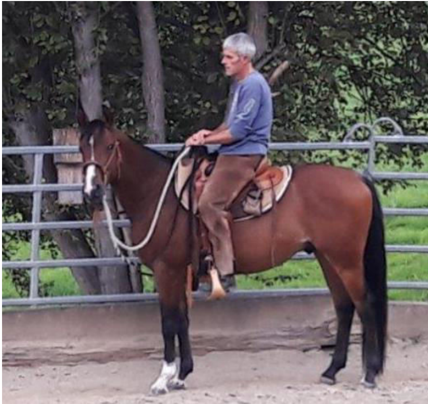
NIL MAJEED, 2013 (Majd Al Arab x Nil Incipit).

A „normal Arabian horse”. Out of race blood lines, more than one year in race training and today a relaxed, calm horse of a gentlemen-rider.