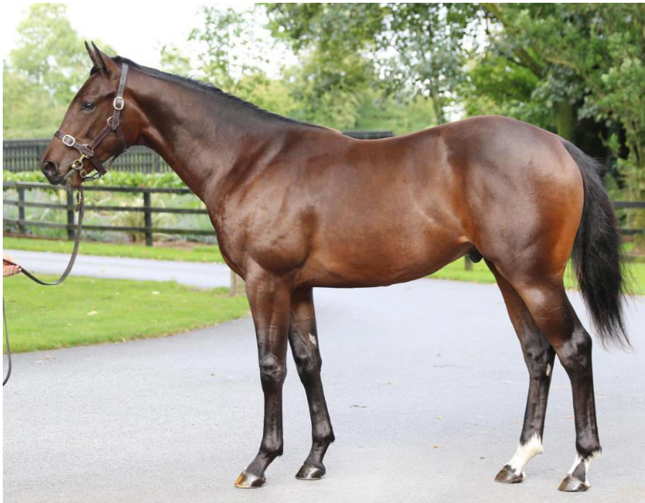
Lot 330 , Top price at the Goffs Ireland Thoroughbred Yearling Sale 2017 with € 1'600'000.

Virtuality stands before reality in today's world and an unlimited number of wishes and visions can be projected into the virtuality of an embryo.