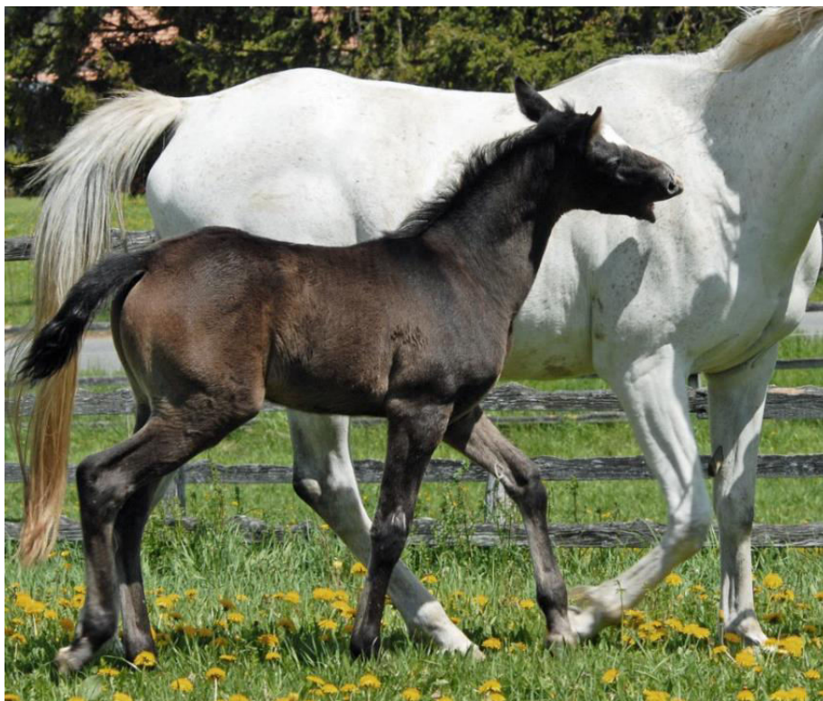
NIL AZIZ, 2012, (Dahess x Nil Abiat)

Second foal of Nil Abiat. Strong colt with lots of substance and a masculine expression.